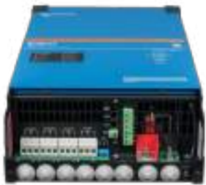
Connection Area Quattro-II 48/5k